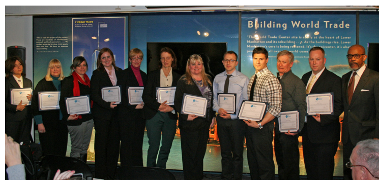
The 2014 Annual Teacher Awards at the 9/11 Tribute Center.

On February 26th, the 9/11 Tribute Center once again celebrated the creativity and dedication of teachers at the 7th annual Teacher Awards. The 9/11 Tribute Center has a strong educational mission and recognizes classroom teachers as allies in our work of teaching children about the terrorist attacks and their aftermath. Although our website provides resources for teachers to use in their classrooms, our Teacher Awards allow us to celebrate and bring attention to the teachers that have built their own unique projects, conversations, or experiences into their classrooms. This year we had dozens of submissions from teachers around the nation. Teachers found ways to integrate 9/11 into a variety of curriculum areas: history, language arts, media and visual and performing arts, psychology, ethics, city planning and community service. There were ten winning projects: 4 winners are from NYC, 2 from upstate NY, 3 from NJ and 1 from North Dakota.