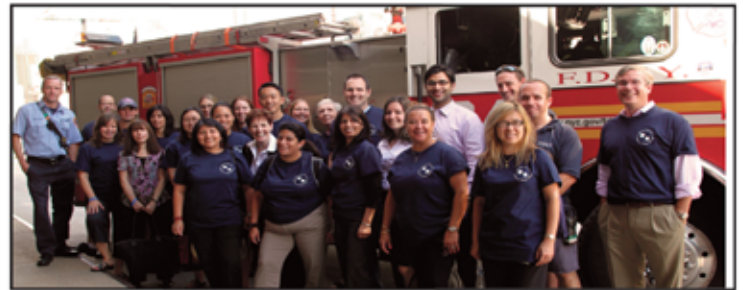
Volunteers from Marsh & McLennan pose with FDNY Engine 34.