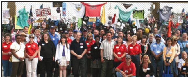
A special thank you to our hosts, for making us feel welcome, and for sharing their stories.

"Our role is to humanize the experience and allow the visitor to really feel connected."