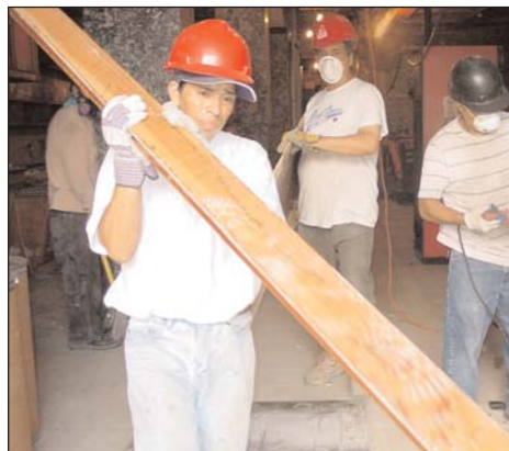
Construction workers complete Phase I of demolition in the Tribute Center.