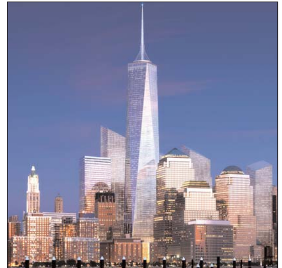
Redesigned Freedom Tower.

Reiterating his commitment to increase the City of New York's role in the downtown rebuilding effort, Mayor Michael Bloomberg announced six new appointments --