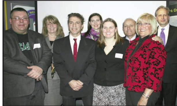
2010 Tribute Center Teacher Award recipients.