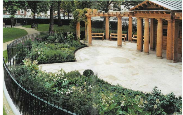
The September 11 th Memorial Garden - Grosvenor Square, London

Many Londoners gathered in the Grosvenor Square (across from the American Embassy) in the days after the attacks, so it is a fitting site for the Memorial. The stone includes an extract from the American poet Henry Van Dyke: Time is Too Slow for those who Wait. Too Swift for those who Fear. Too Long for those who Grieve. Too Short for those who Rejoice. But for those who Love. Time is not. Inscribed across the Memorial's front entrance is the phrase: "Grief is the price we pay for love", a quote from Her Majesty Queen Elizabeth II. A piece of steel salvaged from One World Trade Center is preserved in resin underneath the hand-