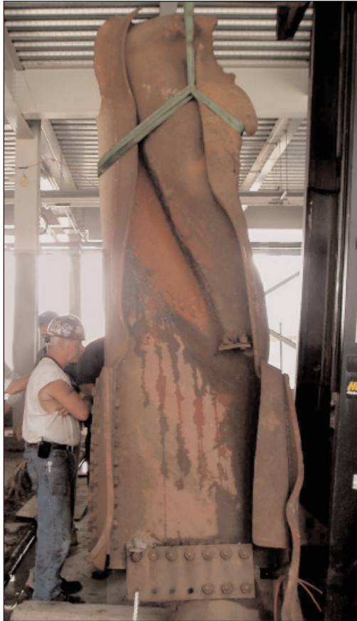
Tribute exhibit team leaders view the steel beam to be installed in the Tribute WTC Visitor Center.