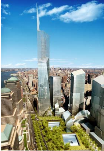
WTC Memorial Aerial Rendering by DBOX courtesy of LMDC.