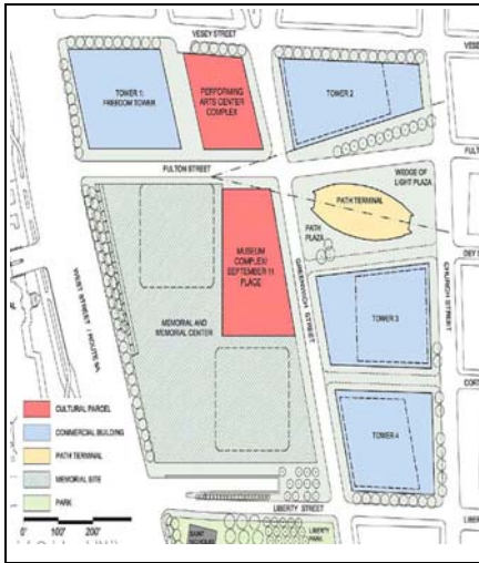
WTC Master Site Plan - LMDC.