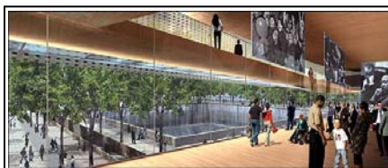
View from inside the International Freedom Center of the WTC Memorial.